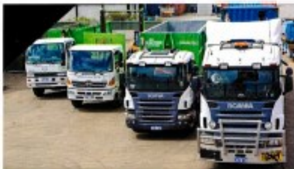
WA OWNED & OPERATED BUSINESS

AAA Metal Recycling Australia Pty Ltd has been operating in Western Australia since 2006. We are a fully accredited WA owned and operated company, providing a valuable service to the public and industry. We operate in two locations for the collection or delivery of scrap material.