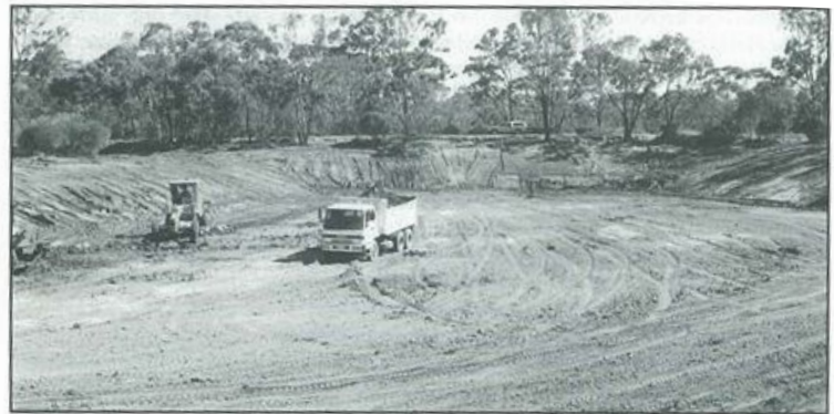
Cleaning of Yornaning Dam.