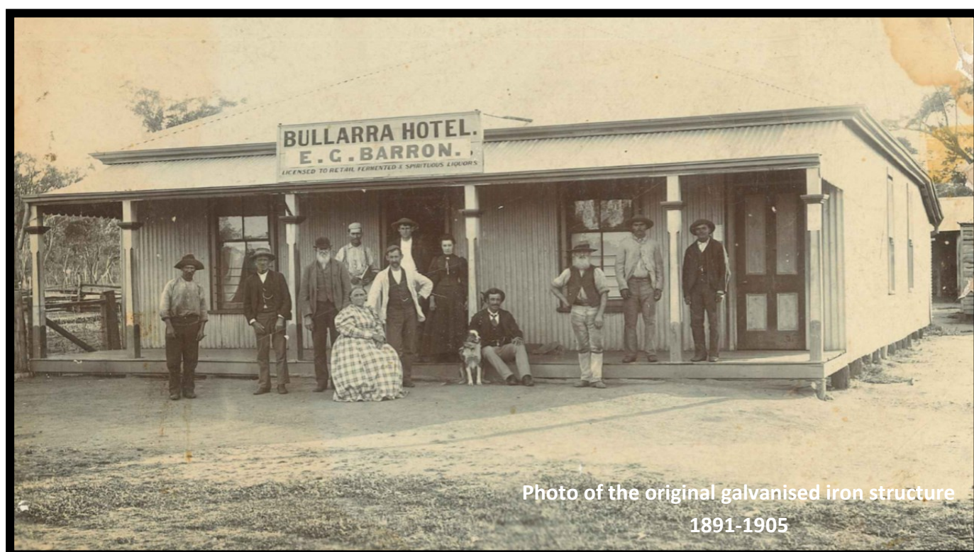
Photo of the original galvanised iron structure 1891-1905

In 1905-06 a brick, single-storey building was erected to replace the original hotel which was practically demolished by a 'cockeyed bob' or cyclonic storm. This new building incorporated the original kitchen and washhouse and had three cellars set into the foundations. In 1912 a second storey was added, containing eleven bedrooms and a bathroom, and later still two showers and toilets were included. Built of local bricks, the hotel features two elaborate pediments that bear the name and date of construction.